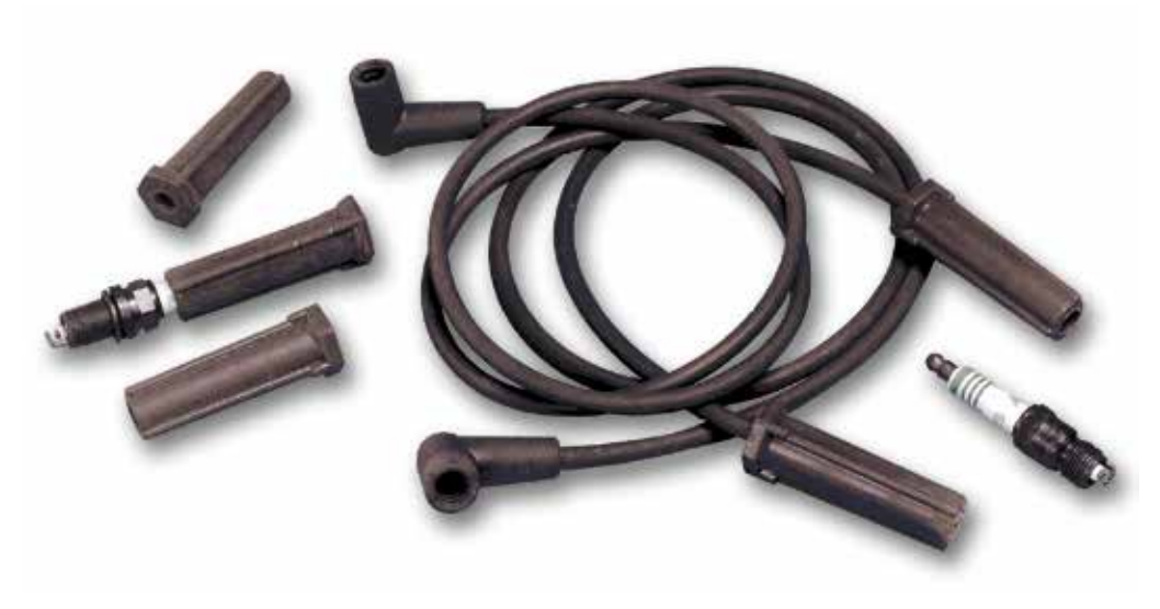
Elastomeric components are unaffected by Krytox™ performance lubricants.

Some applications require grease that is stiff and does not fall back easily into the bearing races. These systems often run at higher speeds. Harder NLGI grade 3 Krytox™ greases are recommended for these applications.