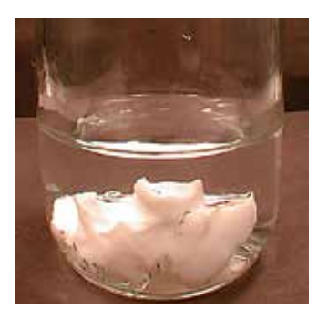
Krytox<sup>™</sup> grease in hydrocarbon solvent is not dissolved.