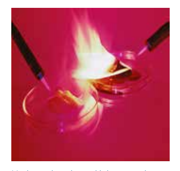
Hydrocarbon-based lubricants burn; \mathsf{Krytox}^{\scriptscriptstyle\mathsf{TM}} \, \mathsf{does} \, \mathsf{not}.