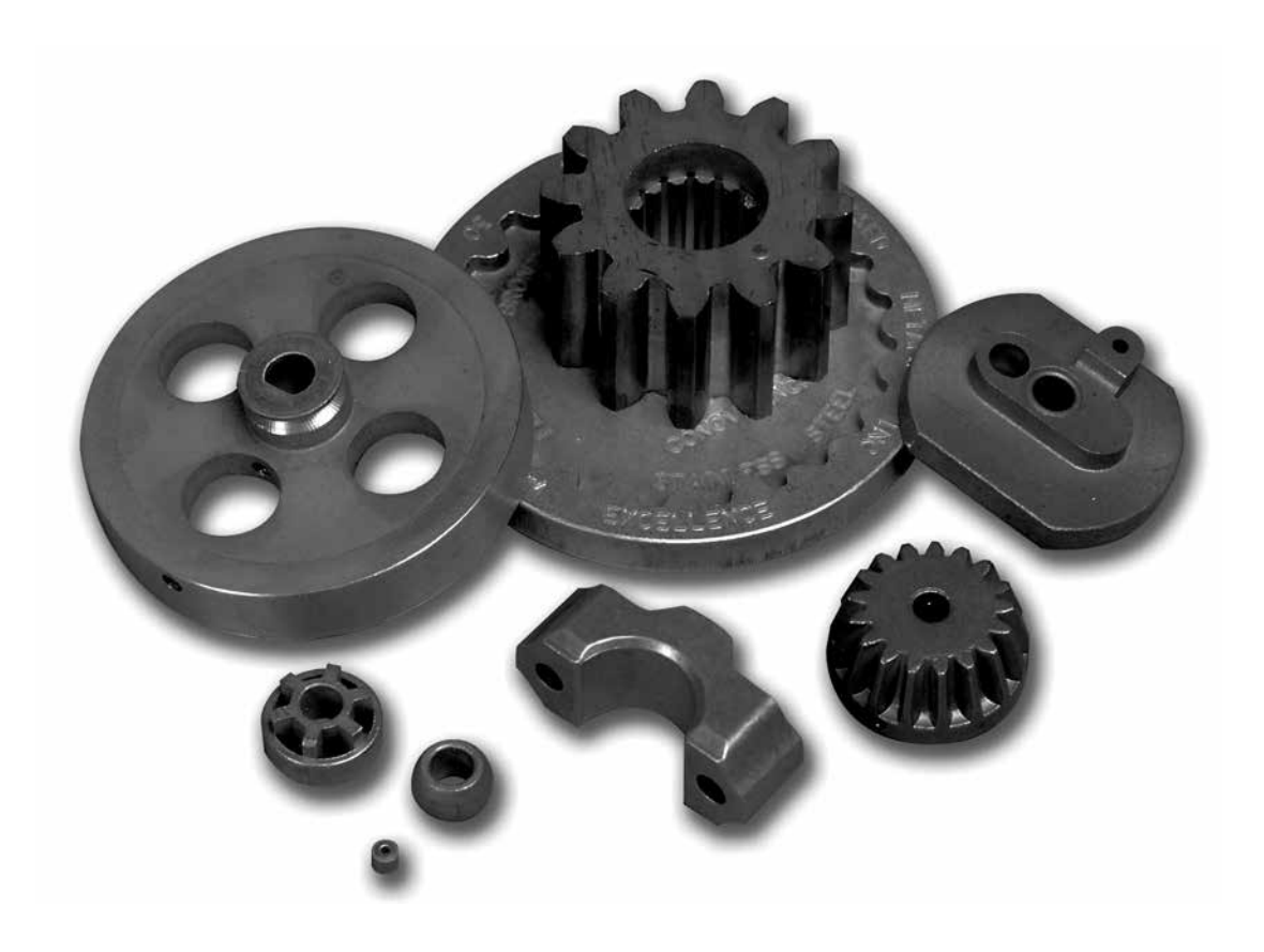
Sintered metal components can be lubricated with \mathsf{Krytox}^{\scriptscriptstyle\mathsf{TM}}\!.