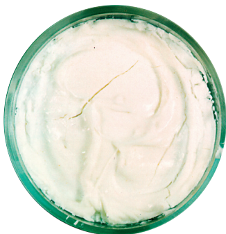
In an oven at 232 °C (448 °F) for 40 hr, Krytox™ lubricant had 0% weight loss.

Krytox™ greases and oils are non-toxic, easy to handle, and do not release volatile organic compounds to the atmosphere. Additionally, Chemours has a regeneration program that reclaims used oil and restores it to its original properties. This lowers the overall cost of lubrication, and eliminates safety and environmental disposal problems.